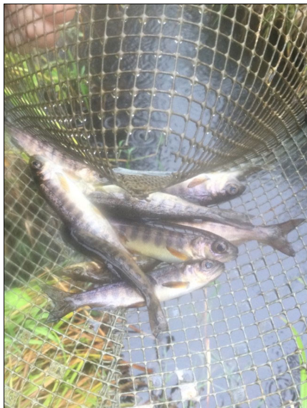
Figure 1.—Juvenile coho salmon captured at waypoint 1827.