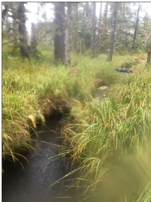
Figure 2.—Stagnant channel at waypoint 1827.